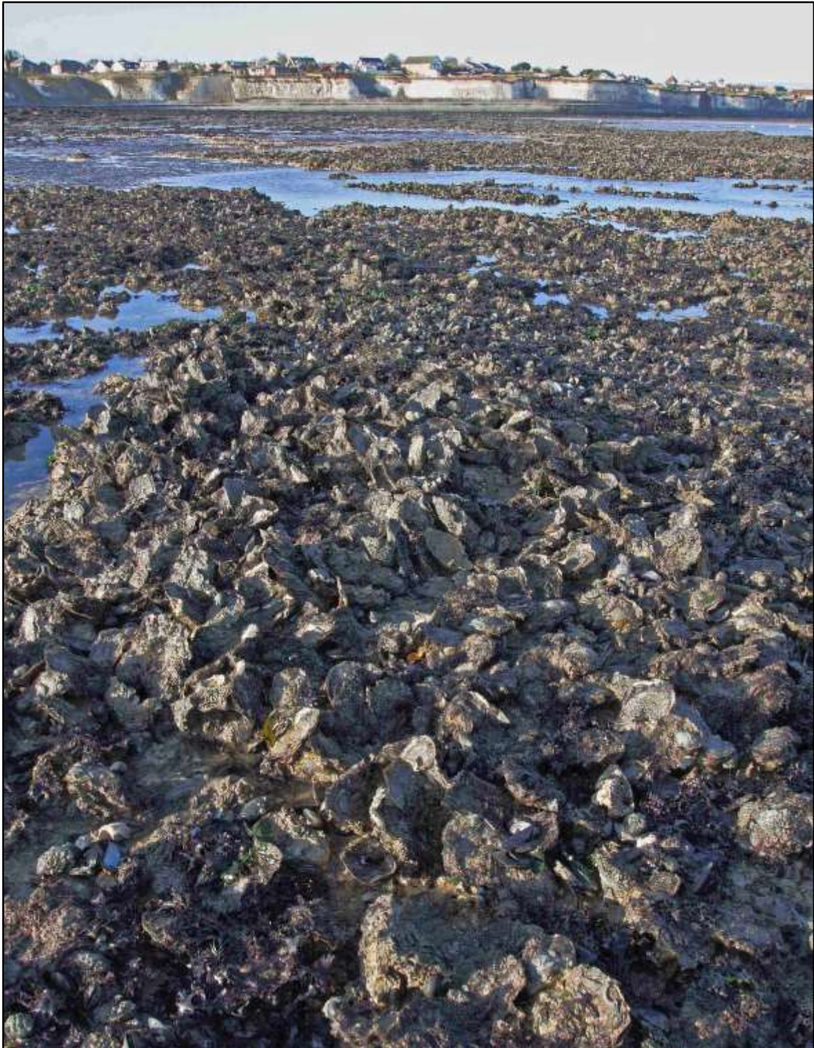
Pacific Oyster reef. Epple Bay, Birchington