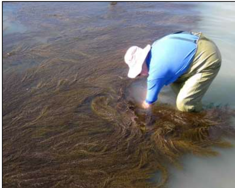
Sargassum muticum control