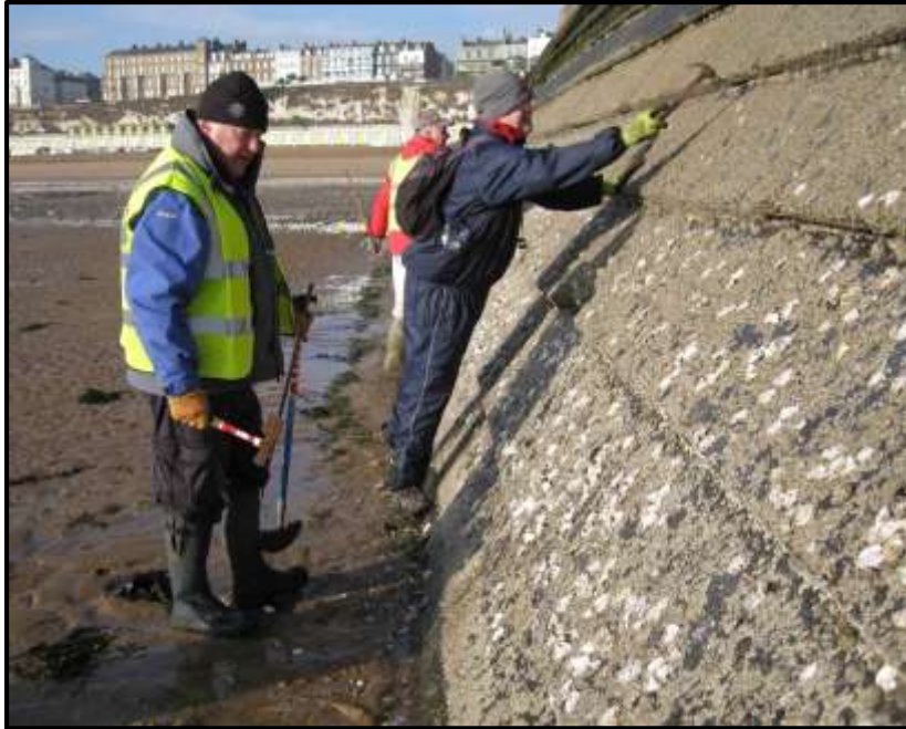
Magallana gigas control